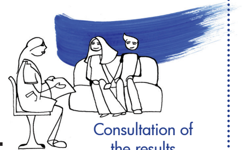
Consultation of the results